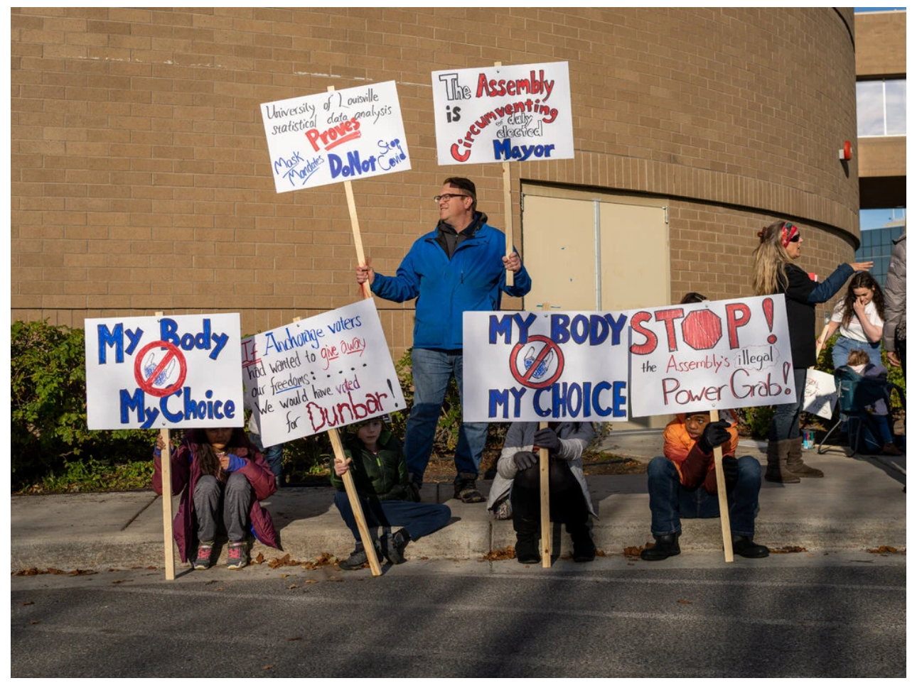
A small crowd outside the Loussac Library protested a mask mandate that the Anchorage Assembly is considering.

Through much of the pandemic, Alaska's natural isolation had shielded the state, with the early months defined by strict testing protocols for people arriving from the outside. Many villages locked down. When vaccines arrived, there was a legion of planes, ferries and sleds to bring doses to far-flung communities. The state has maintained some of the lowest death numbers in the country.