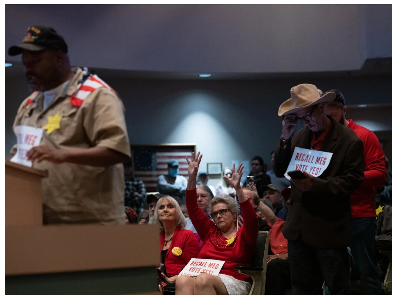
Some opponents of the mask mandate wore yellow Stars of David with the words, "Do Not Comply."

The debate was scheduled to resume for a fourth day on Monday.